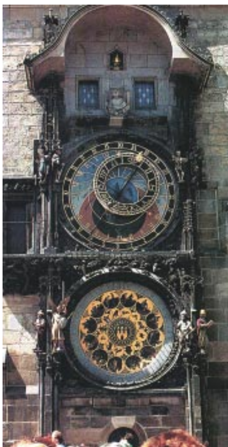
Astronomical Clock, Old Town Square, Prague

never do it justice. The picturesque, narrow, winding streets cling like ribbons to the hills as they follow the terrain around and down to the Vltava River that, in turn, winds around it. Standing watch from above is the majestic castle of the Rozmberk family (one of the wealthiest and oldest noble families in the area). You check into your hotel, the Ruze , which is housed in an historic building that was once a Jesuit monastery. In the evening, you make your à la carte dinner selections