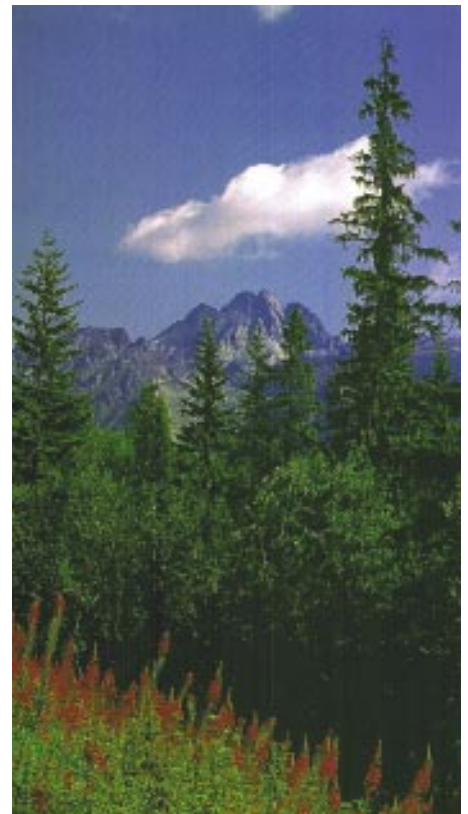
The High Tatra, Zakopane

On this day, you set off in a south-westerly direction to Brno – capital of the Czech province of Moravia and second largest city in the Czech Republic. It sits in a valley where two rivers join, and hills and forests flank three sides of this fertile southern Moravian wine area. At the beginning of the 19 th century, Brno was a center of contemporary Czech culture; in architecture, the city was ranked with the other great European cities. Its location has traditionally connected the industrial northern area with the agricultural south