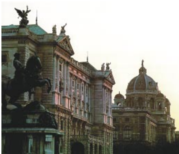
Imperial Palace, Vienna

never do it justice. The picturesque, narrow, winding streets cling like ribbons to the hills as they follow the terrain around and down to the Vltava River that, in turn, winds around it. Standing watch from above is the majestic castle of the Rozmberk family (one of the wealthiest and oldest noble families in the area). You check into your hotel, the Ruze , which is housed in an historic building that was once a Jesuit monastery. In the evening, you make your à la carte dinner selections