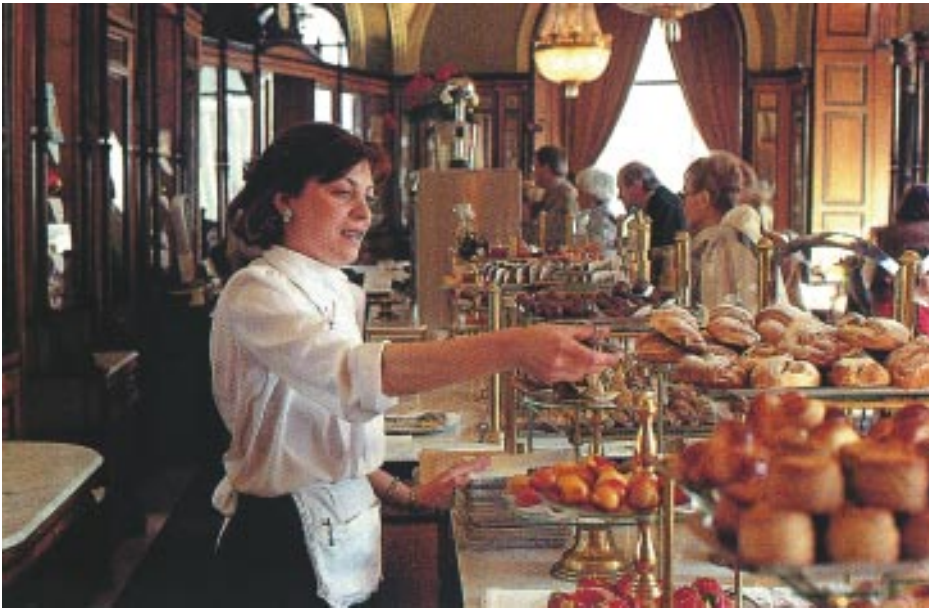
Coffeehouse Gerbeaud, Budapest

art enthusiasts. You have lunch here and the opportunity to visit the museums and galleries before returning to Budapest. There is ample time this afternoon back in Budapest to browse through some of the antique shops or bookstores. Look at the interesting ceramics, baskets, and country furniture at shops like Almarium on Avenue Volegeny. The Wine Society on Battyany Utca has a great selection of Hungarian wines. This evening you go to the Gundel Restaurant for an à la carte dinner, where you choose from a marvelous variety of Hungarian specialties. For dessert, you have many delicious choices, including Palatschinken (crepes), a house specialty. (B,L,D)