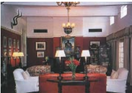
Victoria Falls Hotel

Shortly after breakfast this morning, the train climbs higher to 2,994 feet and