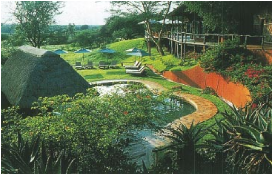
MalaMala Game Reserve

This evening you stay at one of these wine estates, in a spectacular setting in the Jonkershoek Valley, the Lanzerac Manor and Winery . This 300-year old country estate is one of the region's most distinguished Cape Dutch Manor Houses.