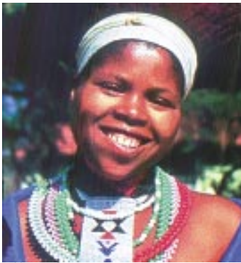
Young Bantu woman

A dominant feature of the Cape Town scene, Table Mountain is a massive block of sandstone overlooking the city and Table Bay. This morning, you take the cable car up to the 3,300-foot summit. The views from the top are phenomenal. You stop at the Kirstenbosch Botanic Gardens on the eastern side of Table Mountain; one of the most beautiful in the world, it is devoted almost exclusively to indigenous plants.