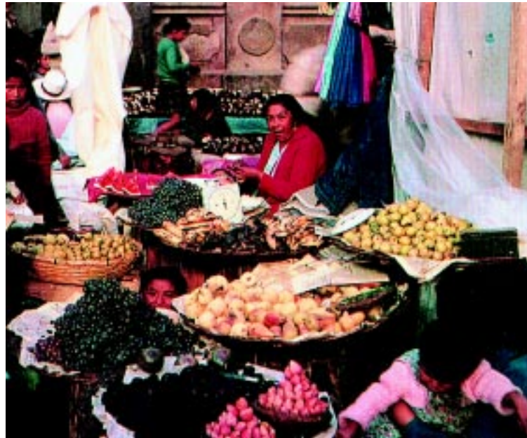
Market in Cuzco

CUZCO IS 11,500 FEET ABOVE SEA LEVEL; PLEASE CHECK WITH YOUR PHYSICIAN IF THIS IS A CONCERN FOR YOU.