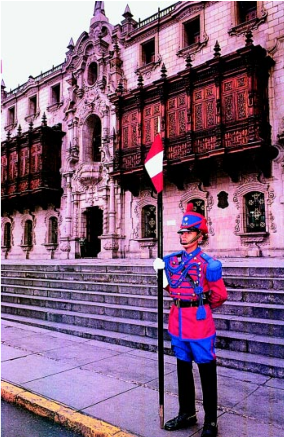
Plaza de Arma - Lima

Moorish interior in addition to thousands of books and parchments dating from the 15 th to 18 th centuries and a marvelous collection of religious art.