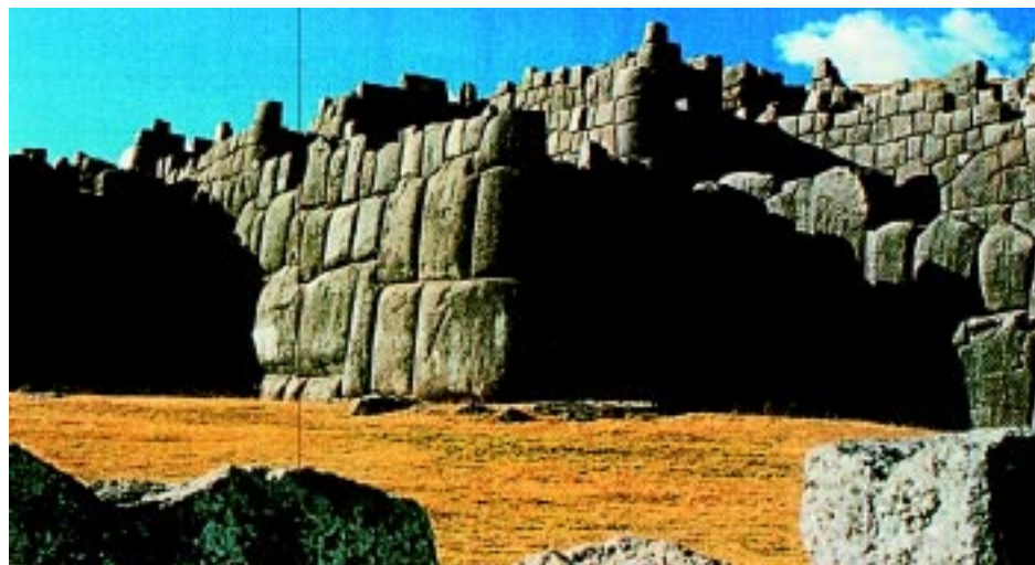
Cuzco's City Wall

Those of you who have chosen to continue your journey, by including a visit to Chile, Argentina, and Brazil, are escorted to the airport for your flight to Santiago. (B)