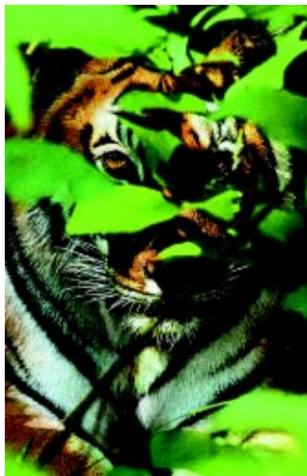
The elusive tiger at Tigertops

Today, your guides accompany you on a safari as they introduce you to the incredible array of flora and fauna in the park. Riding on the backs of elephants, you explore the tall grasslands and forests searching for the great Indian one-horned rhinoceros, wild boar, sloth bear, and the elusive, nocturnal Royal Bengal tiger.