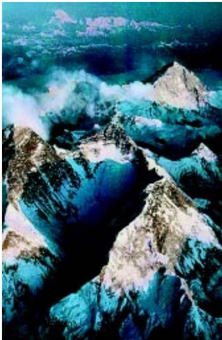
Mt. Everest (left) and Lhotse

This afternoon, you fly to Kathmandu, Nepal. Checking into the Hotel Yak & Yeti , (unquestionably the best hotel in Kathmandu), you are treated to a warm welcome in the 18 th -century palace. The sound of trickling water carries through the lovely gardens; the ornate grand lobby combines brick, pink