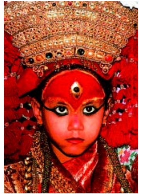
'Kumari', the living goddess, Kathmandu

This morning, on your tour of the city, you stop at Durbar Square – the heart of Old Kathmandu and site of one of the greatest concentrations of temples, shrines,