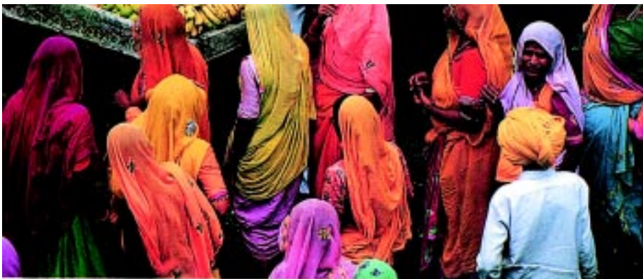
Colors of India

Your hotel tonight is the newly built Rajvilas – six years in the making; but the result is a masterpiece. Designed to resemble a small Rajasthani fort from the front, this intimate, exclusive resort has fountains, sculptures, walking paths, and a lily pond - set around a restored Hindu temple. Impressive attention to detail is evident throughout. The luxurious guest rooms incorporate a fluid mix of colonial and Rajasthani styling; nothing has been omitted for your pleasure. (B,L,D)