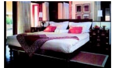
Room at Rajvilas, Jaipur

Driving on, you come to Agra, a flourishing capital of the Mughal Empire in the 16 th and 17 th centuries. At the Taj Mahal, you see one of the Seven Wonders