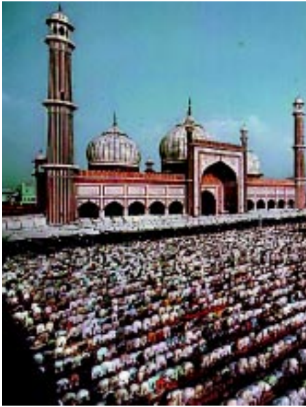
Jama Masjid mosque, Delhi