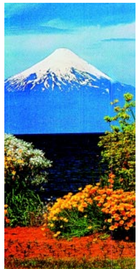
Volcanoes and lakes of South Chile

This evening, you dine at a local restaurant where you may select from local dishes, such as curanto , a delicious stew of fish, shellfish, and potato accompanied by special bread called milcao . A selection of local wines complements the assorted courses. Afterward, sample some of the pastries that are so popular here. (B,L,D)