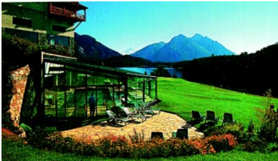
View from Hotel Llao Llao - Bariloche