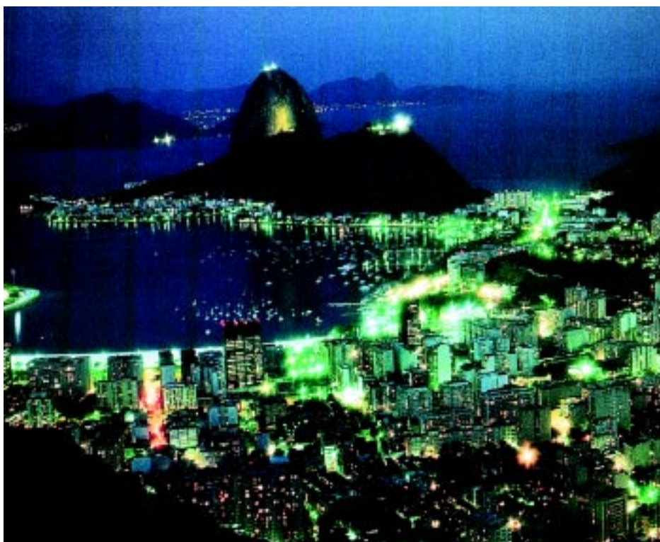
Rio de Janeiro by night

Tonight, after dinner in Rio, you attend a lively musical performance. Song and dance have been shaped by Brazil's rich ethnic background; they are very evident at Carnival time, but are also very significant in the everyday life. Whether it is the samba, the salsa, or the merengue, the music will have you moving your feet in no time. (B,D)