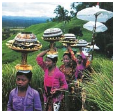
Young Balinese ladies

This morning, drive a short distance through Mas (a center for woodcarving) to the serene cultural center of Bali – the village of Ubud. There are