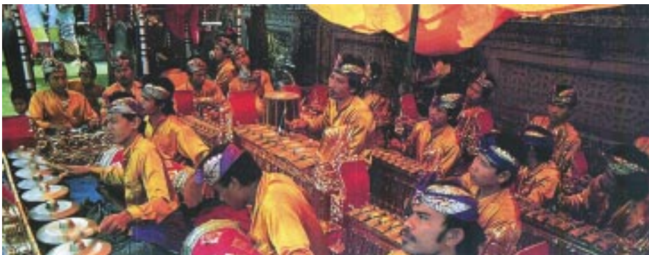
Musicians - Bali

Today you call at Badas, the ancient capital of the western part of the island of Sumbawa. In the 14 th century, this island became prosperous through trade in native horses, rare timber, and fragrant sandalwood. Once the seat of a powerful