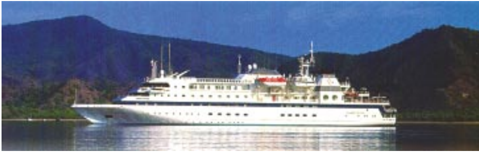
'M/V Oceanic Odyssey'

The “magic” of Bali is rooted in the fact that the island is religiously distant from the rest of Indonesia – unlike its Muslim neighbors, the Balinese are Hindus. The people believe every living thing contains a spirit; when they pick a flower as an offering to the gods, they first say a prayer to the flower. These offerings are made from dawn till dusk, to placate evil spirits and to honor helpful ones.